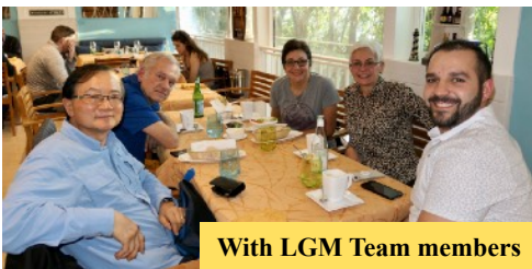
With LGM Team members