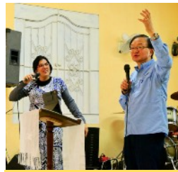
Conducting the GHN Seminars in Cuba