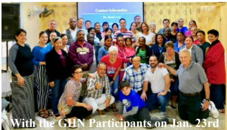
With the GHN Participants on Jan. 23rd