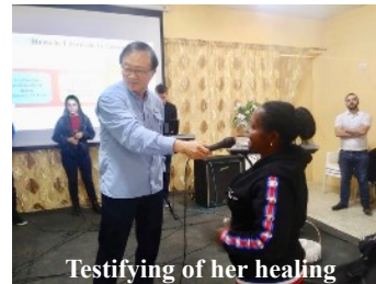
Testifying of her healing