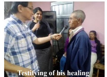
Testifying of his healing