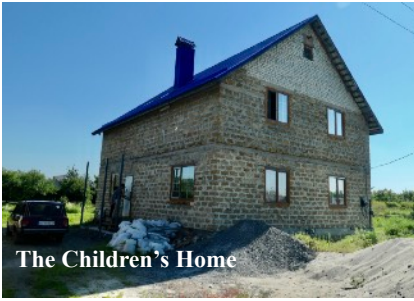
The Children's Home