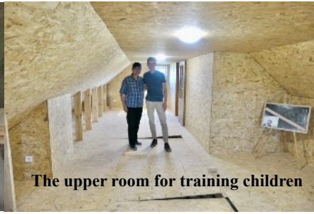
The upper room for training children