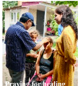
Praying for healing