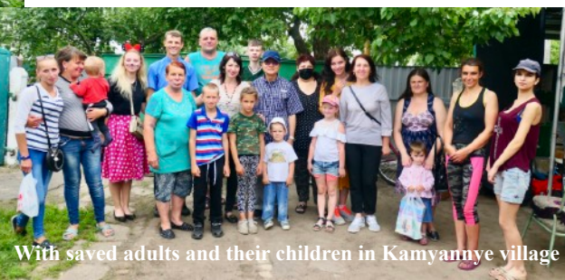
With saved adults and their children in Kamyanye village