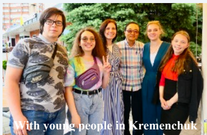
With young people in Kremenchuk