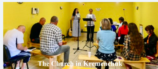
The Church in Kremenchuk