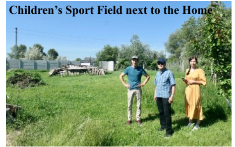
Children's Sport Field next to the Home