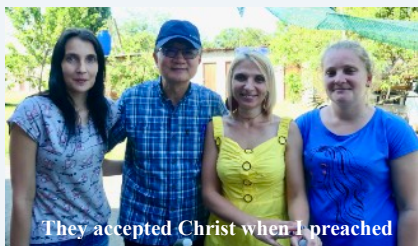
They accepted Christ when I preached