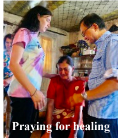
Praying for healing