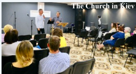
The Church in Kiev