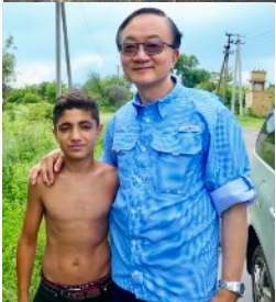
A young boy was deaf in both ears. After I prayed for him, he was able to hear (40%) for the first time.