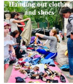
Handing out clothes and shoes