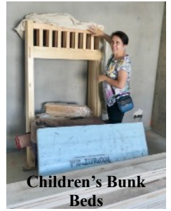
Children's Bunk Beds