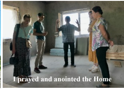
I prayed and anointed the Home