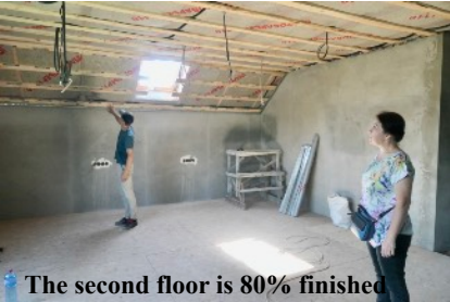
The second floor is 80% finished