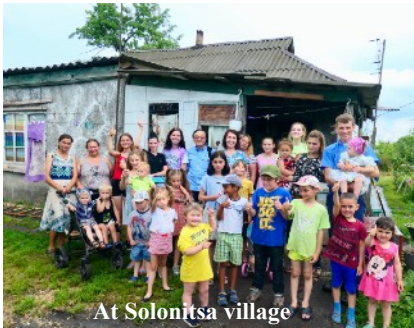
At Solonitsa village