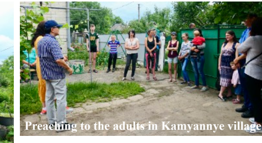
Preaching to the adults in Kamyanye village