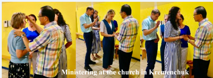
Ministering at the church in Kremenchuk