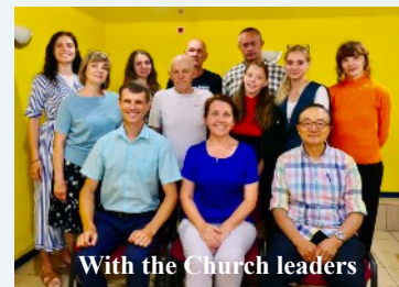
With the Church leaders