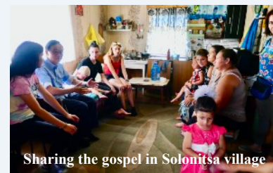
Sharing the gospel in Solonitsa village