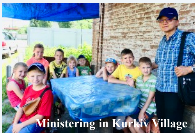
Ministering in Kurkiv Village