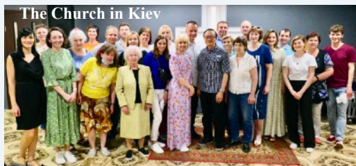
The Church in Kiev