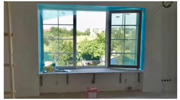
They began to put insulation panels outside and inside of the walls.