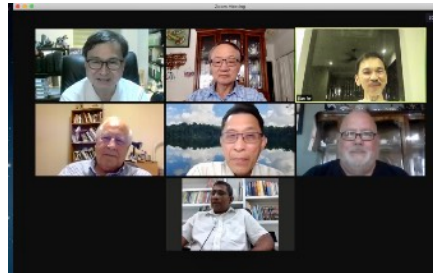
Praying with Leaders on Wednesdays