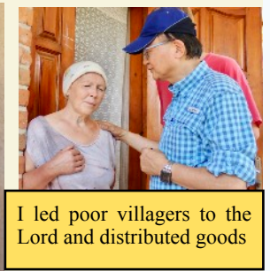
I led poor villagers to the Lord and distributed goods