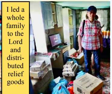
I led a whole family to the Lord and distributed relief goods