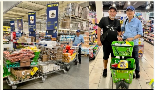
We purchased relief goods and visited 10 poor homes in three different villages near Vinnytsia and distributed goods and led all the family members to the Lord at each home. I was able to lead a 92 year old lady to the Lord and when we gave relief goods, she thanked us with tears in her eyes.