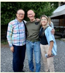
I led an Airborne special force soldier (L) to the Lord and delivered him of PTSD.