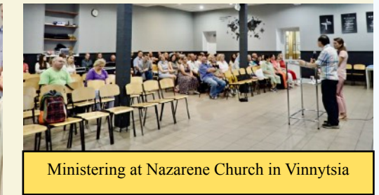
Ministering at Nazarene Church in Vinnytsia