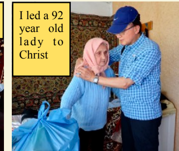
I led a 92 year old lady to Christ