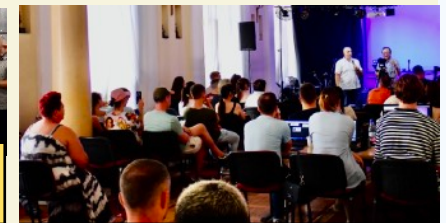
A Ukrainian Church in Warsaw, Poland