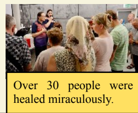
Over 30 people were healed miraculously.