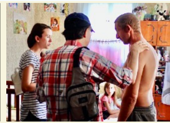
I led a Ukrainian soldier who was going to the front line the next day to the Lord.