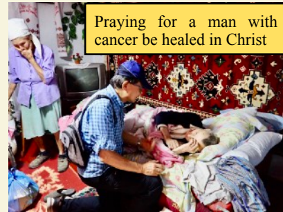
Praying for a man with cancer be healed in Christ