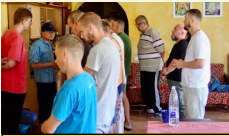
I led male and female drug addicts in two rehab centers to the Lord